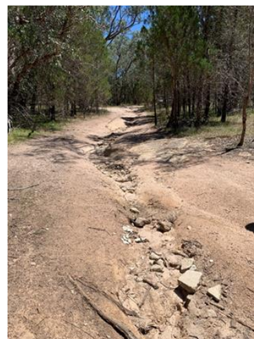
Rocky Crossing before the works (above) and after the upgrade (below)

For further enquiries about this work, please contact info@parks.vic.gov.au or 13 19 63.